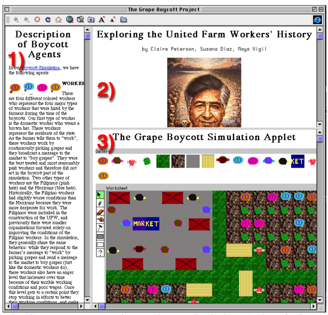
The Grape Boycott project web page includes (1) descriptions of the agents, (2) historical background and related links, and (3) the simulation applet.

Once the students understood the basic facts about the boycott, they began to create their simulation. Presenting a complex social phenomenon such as the boycott without making the simulation overwhelmingly complex was a challenging project for these teenagers. Their first task