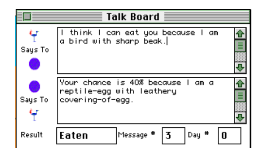
Conversation between Guglle-Buglle and Squirm egg

The collaborative nature of creating an EcoWorlds simulation also pushes students to think more deeply about science concepts. Students were told that each animal must either eat or be eaten by at least one animal created by another student. In the process of negotiating the predator-prey relationships, students had to justify their ideas about their animals to one another.