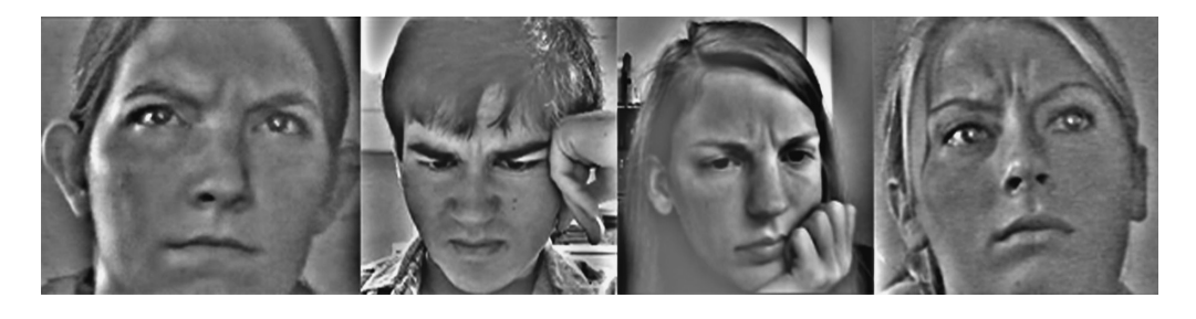
Figure 15.1 Facial expressions of confusion.

Darwin's (1872) observations about the emergence of frowns during disruptions of thought has been systematically confirmed in the few studies that have investigated the facial correlates of confusion. Using a theory-guided approach, Craig and colleagues (2008) performed an emote-aloud study where seven learners verbally expressed their emotions (as they occurred) during interactions with AutoTutor. Video recordings of learners' faces were manually coded for facial movements using the Facial Action Coding System (FACS; Ekman & Friesen, 1978). The Action Units (AUs) were correlated with online verbal reports of confusion. They found that a lowered brow (AU4), tightened lids (AU7), and combinations of these two facial movements (AU4 + AU7) were associated with confused expressions (see Figure 15.1). The lip corner puller (AU12) yielded a weaker but notable association with confusion. In a subsequent study (McDaniel et al., 2007),